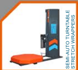
SEMI-AUTO TURNTABLE STRETCH WRAPPERS