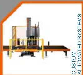
CUSTOM AUTOMATED SYSTEMS