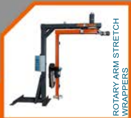
ROTARY ARM STRETCH WRAPPERS