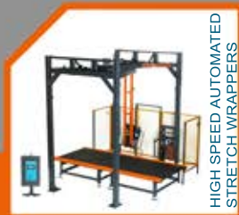
HIGH SPEED AUTOMATED STRETCH WRAPPERS