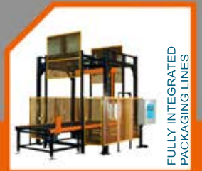
FULLY INTEGRATED PACKAGING LINES